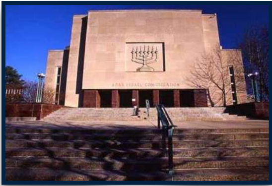
Adas Israel Congregation in Washington D.C.