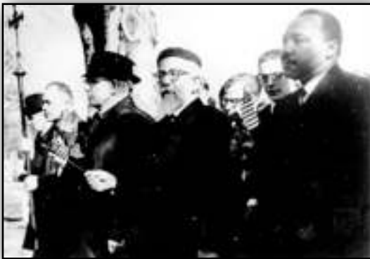
Rabbi Abraham Joshua Heschel with the Rev. Dr. Martin Luther King marching in Selma in the 1960s.

1963—Rabbi Joachim Prinz tells the Washington gathering that hatred and bigotry are not the most urgent problems; but that the most urgent, disgraceful and shameful problem is "silence".