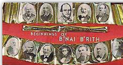
Rare images of the men who founded B'nai B'rith at Sinsheimer's Café in New York City on October 13, 1843.

(CINCINNATI, OHIO and WASHINGTON, D.C., May 24, 2012)—B'nai B'rith International—widely considered by scholars and historians to be the most important Jewish membership organization in American Jewish history—has announced that the contents of its archives and its Holocaust and Related Materials Archives will be relocated to the Jacob Rader Marcus Center of the American Jewish Archives in Cincinnati, Ohio (AJA). The AJA is located on the Cincinnati campus of Hebrew Union College-Jewish Institute of Religion.